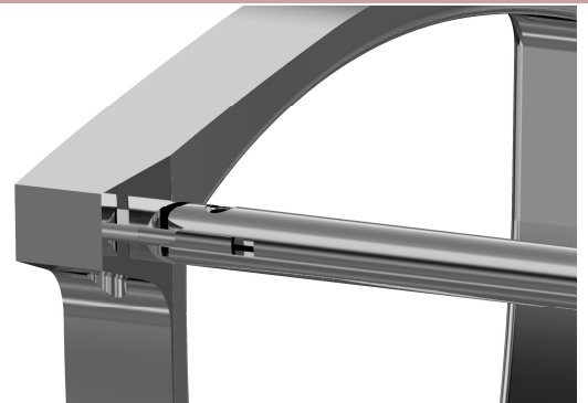
52-07058.400 - SIDE DISH