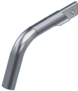
52-07058:600 - ELEPHANT